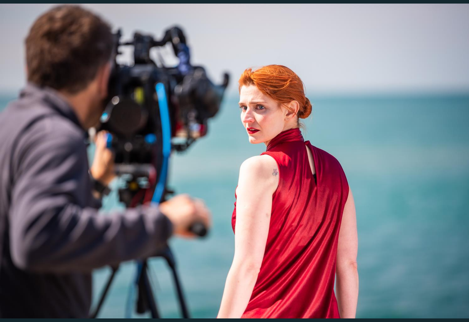
TO DOWNLOAD BEHIND THE SCENES IMAGES, GO TO GALLERY AT WWW.STRANGEWATERS.CO.UK